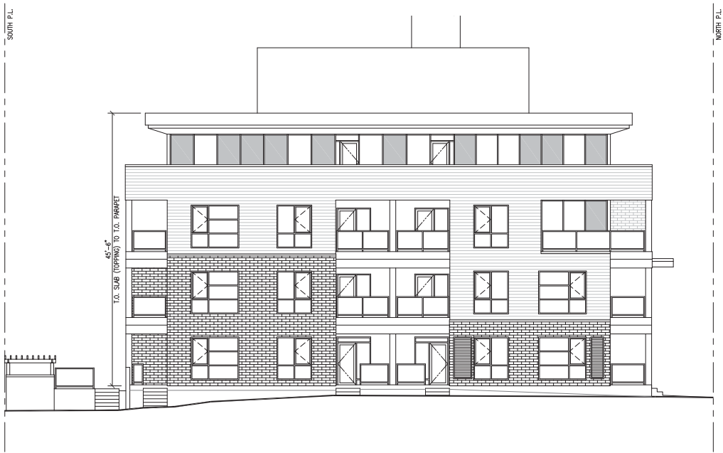
02 EAST ELEVATION A301 SCALE: 1/8" = 1'-0"