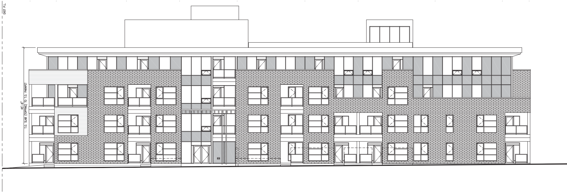
01 NORTH ELEVATION A301 SCALE: 1/8" = 1'-0"