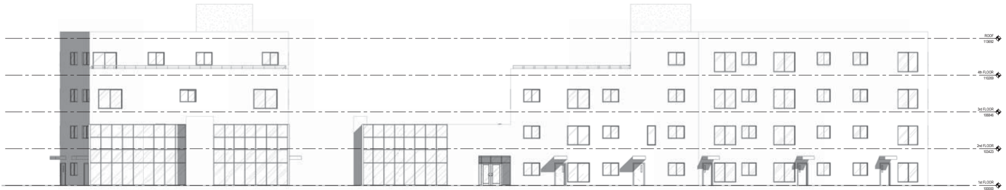
EAST ELEVATION SCALE: 1:100