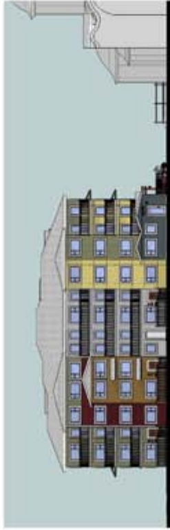
T4 AVENUE ELEVATION