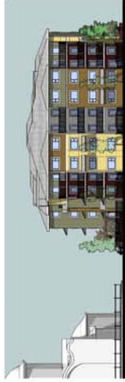
112 AVENUE ELEVATION