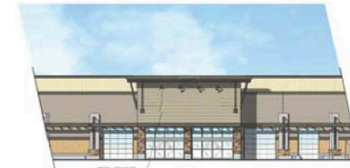
3 ENTRY ELEVATION SCALE: 1:200