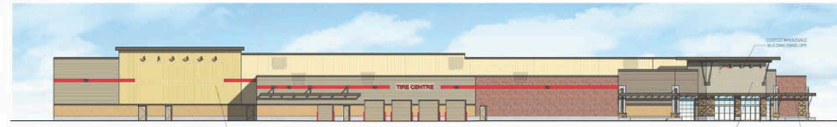
2 WEST ELEVATION SCALE: 1:200 (SEE ELEVATION 1 ABOVE FOR ADDITIONAL NOTES)