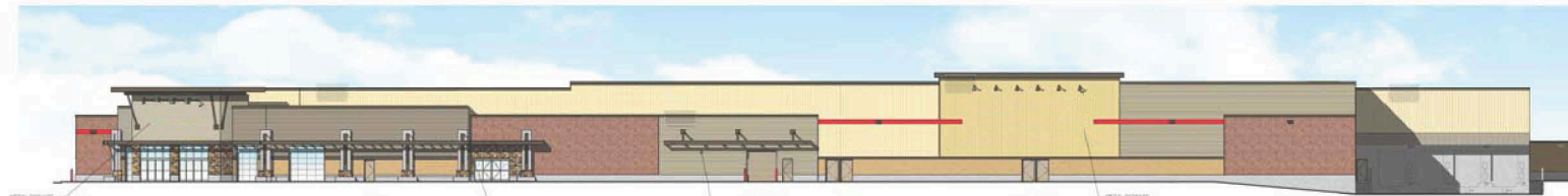
1 SOUTH ELEVATION SCALE: 1:200