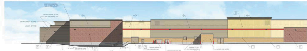
5 EAST ELEVATION SCALE: 1:200 (SEE ELEVATION 1 ABOVE FOR ADDITIONAL NOTES)

ADDRESS 1234567890 SCALE: 1:100 (SUPPLIED AND INSTALLED BY M.B.S.) 1008