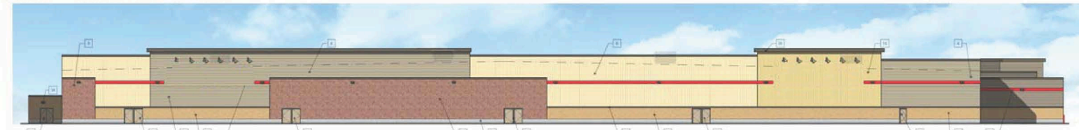
4 NORTH ELEVATION SCALE: 1:200 (SEE ELEVATION 1 ABOVE FOR ADDITIONAL NOTES)