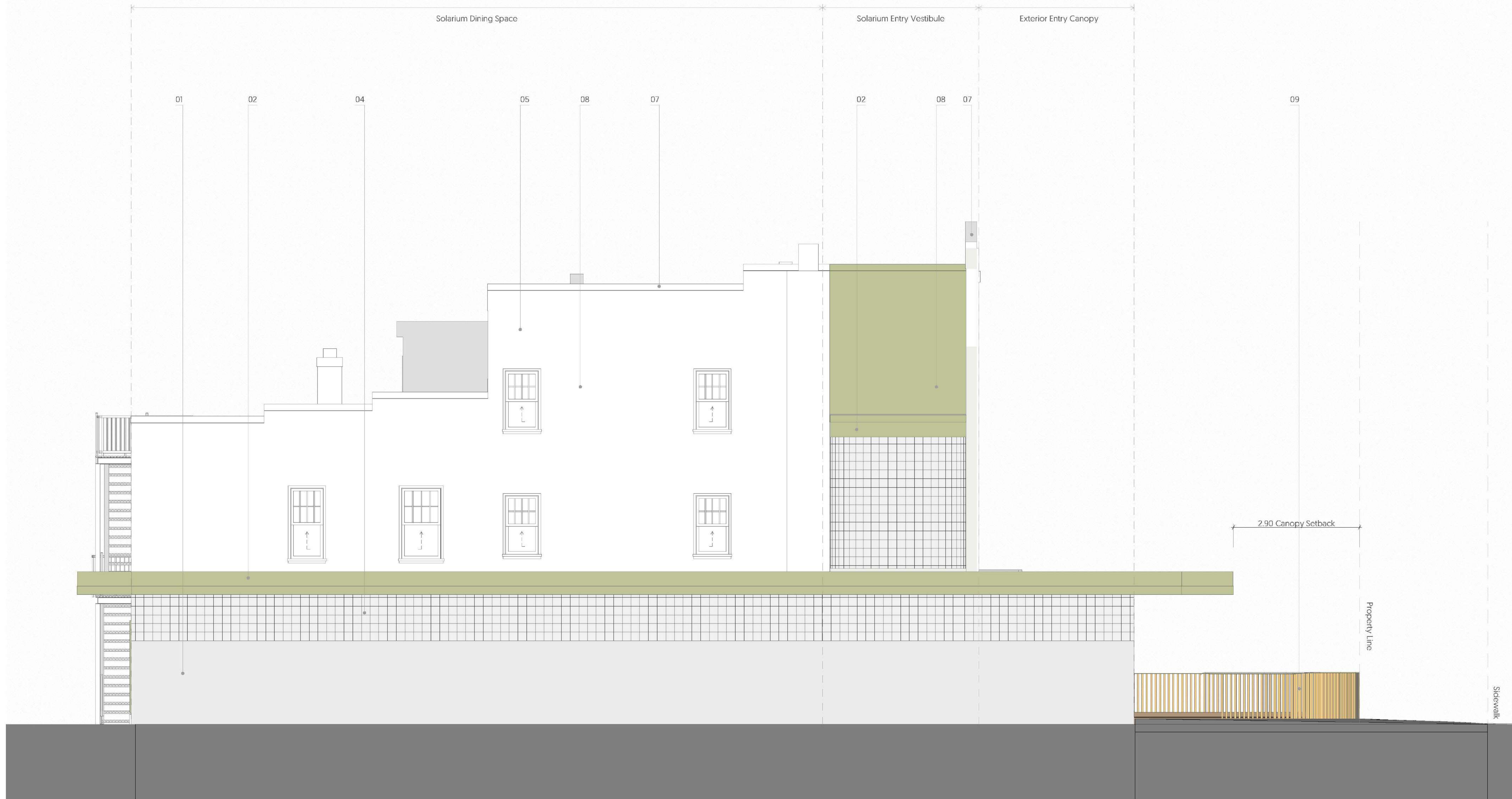
1 North Elevation A102 SCALE: 1/4" = 1'-0"