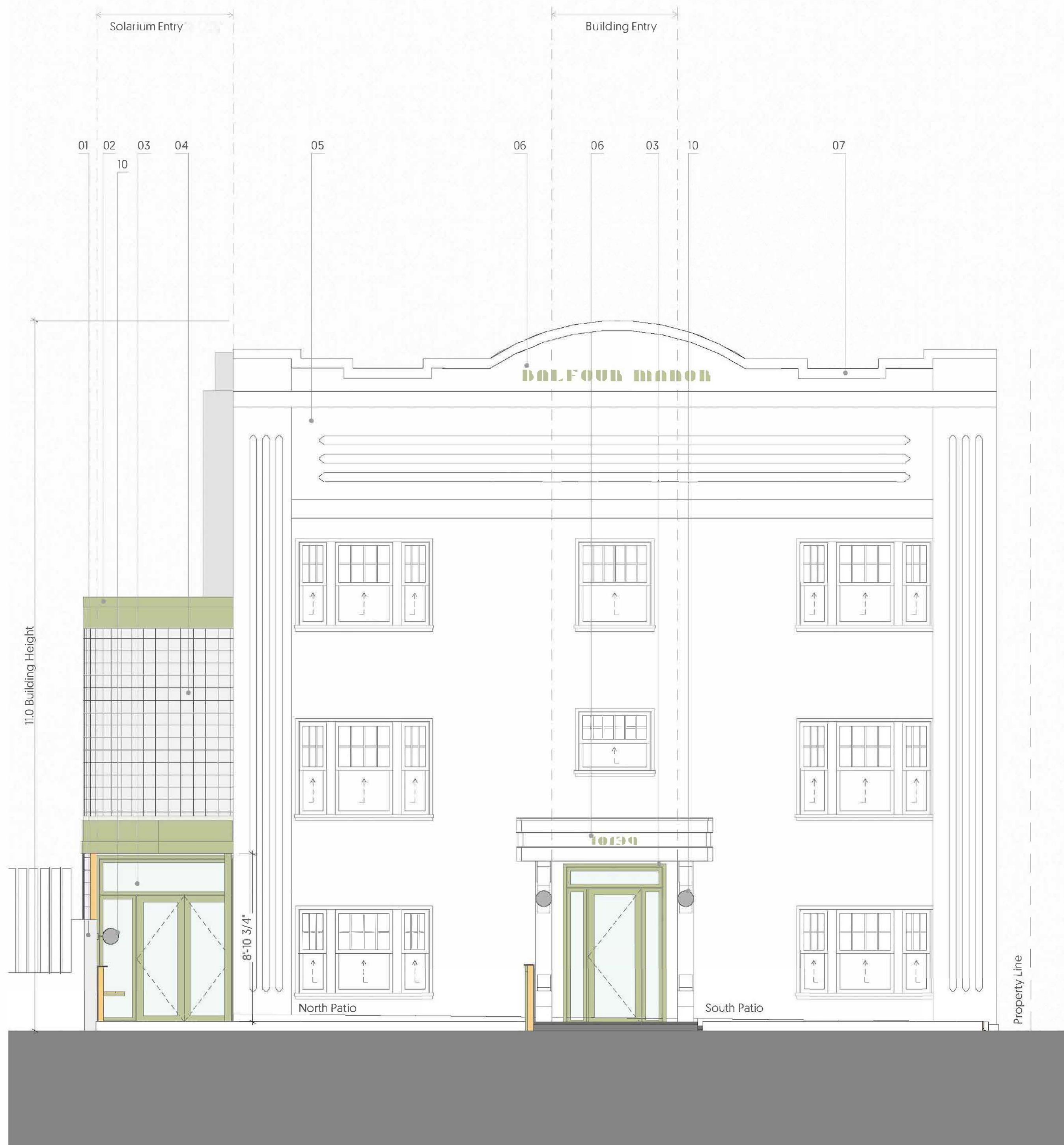
1 West Elevation A101 SCALE: 1/4" = 1'-0"