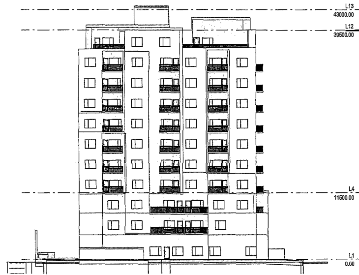
2 | SOUTH