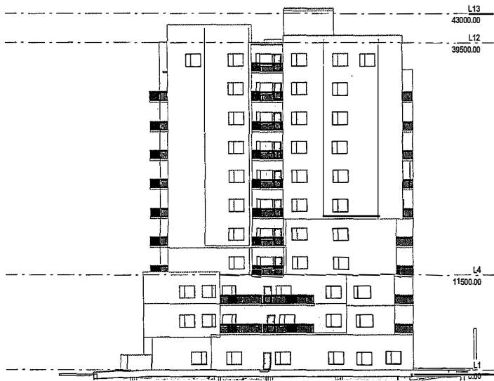
3 | NORTH