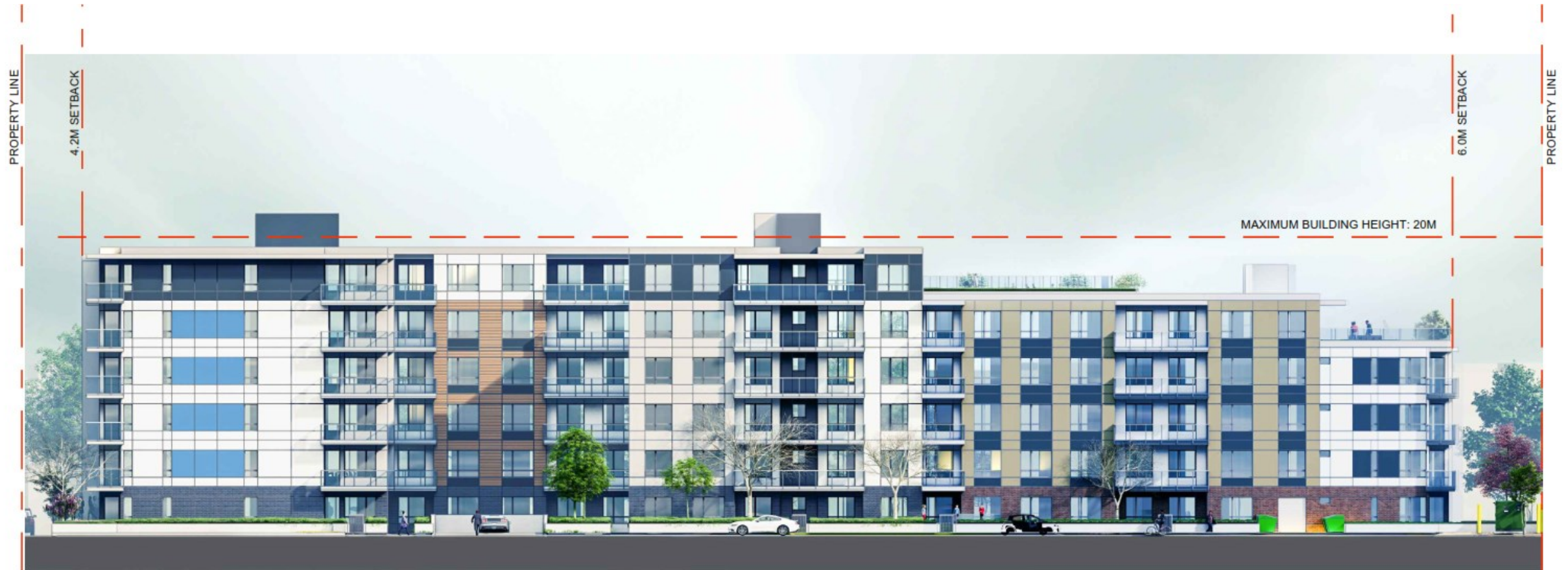
Appendix 2a – East Elevation