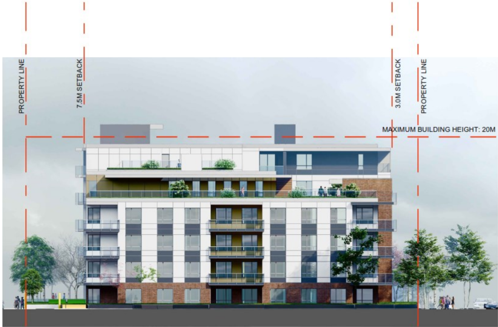
Appendix 2b – North Elevation