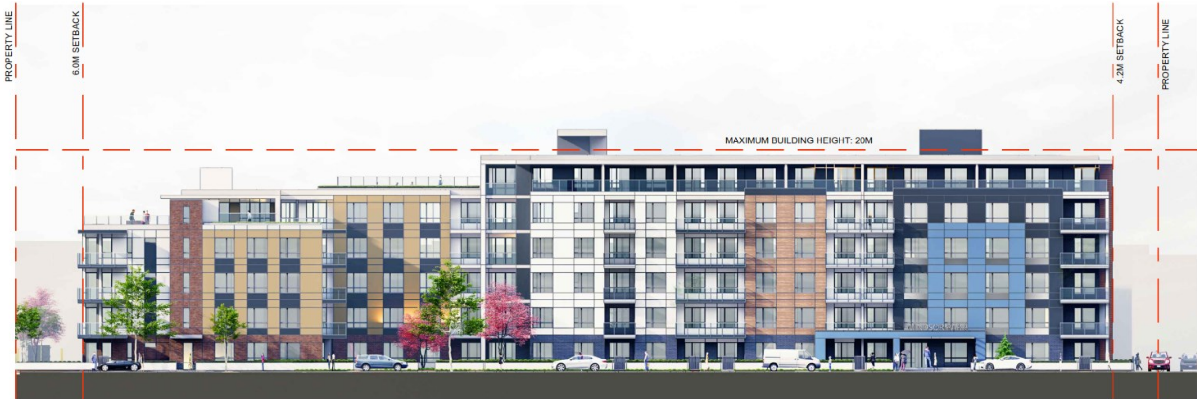
Appendix 2c – West Elevation