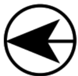
Appendix 1 – Site Plan