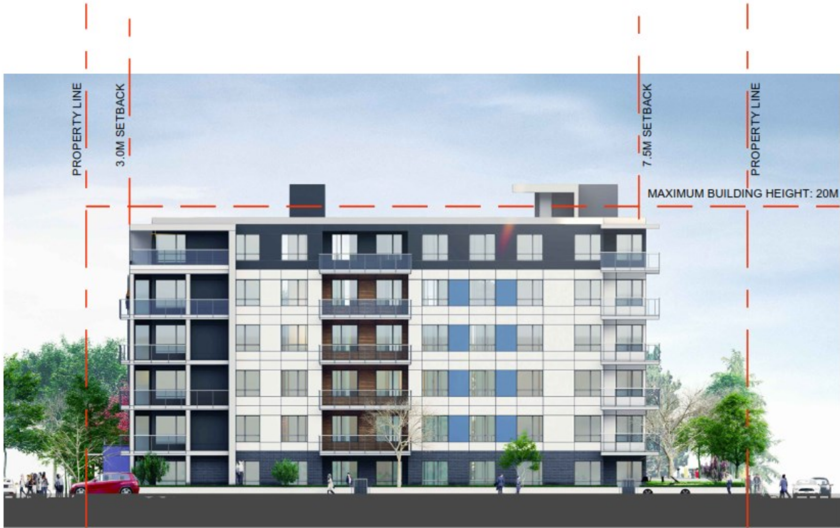
Appendix 2d – South Elevation